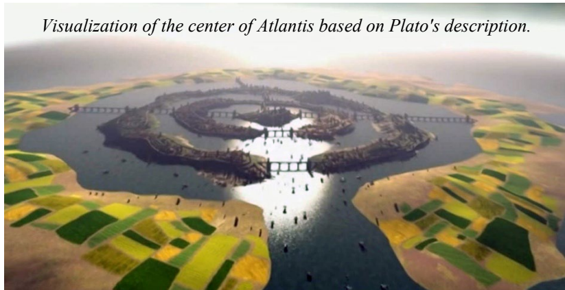
Visualization of the center of Atlantis based on Plato's description.

That’s typical! She’s so bubbly, full of energy, and eager to discover new things—no one else would come up with such a brilliant idea!